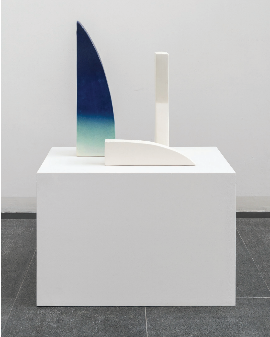
Untitled, 2016 3 Ceramic objects Dimensions: variable Edition of 2, plus 1AP Inv# 4497.1